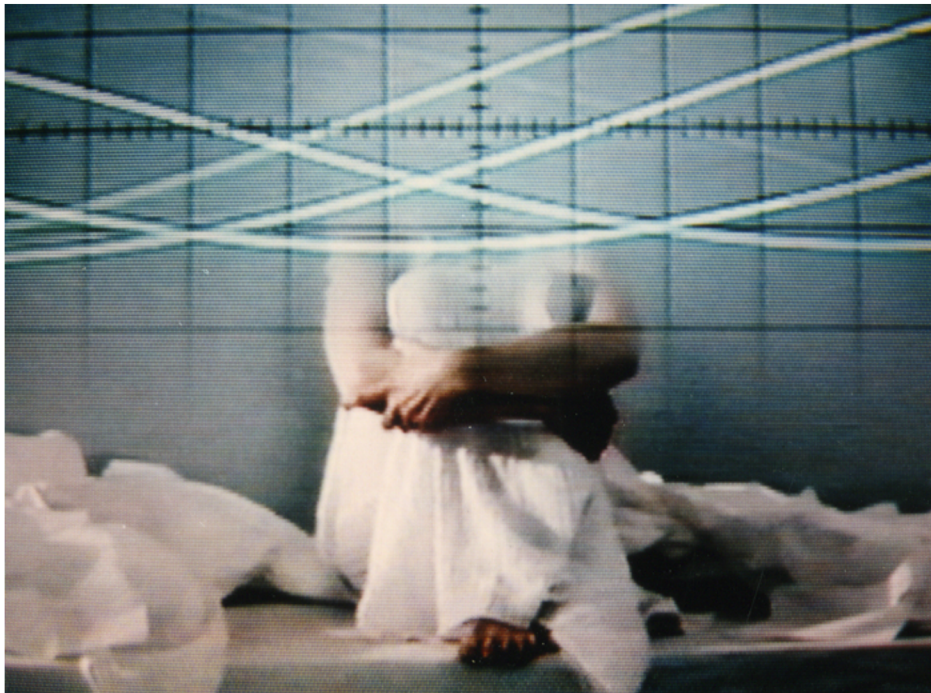
Lynn Hershman Leeson, Seduction of a Cyborg , 1994, DVD with sound, still image, 6 minutes, 48 seconds.

VanDerBeek created eight "Poemfield" works, two of which were shown in the exhibition, using one of the first computer animation languages, called Beflix (from Bell Labs Flicks), designed by Ken Knowlton at Bell Labs. With their vibrant geometric mosaics of flashing patterns and text accompanied by experimental music, these immersive installations felt startlingly modern, despite employing a long-gone software.