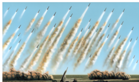
Oliver Laric, Versions (Missile Variations) (detail), 2010, airbrushed paint on aluminum composite board in 10 parts, 9 7/8" x 17 3/4". ©OLIVER LARIC/COURTESY THE ARTIST AND SEVENTEEN GALLERY, LONDON/PRIVATE COLLECTION, LONDON

Given the breakneck pace of technological evolution, the soft- and hardware tools employed by artists are often outmoded almost as soon as the works are created. (E.A.T. performances, such as Frank Stella and Mimi Kanarek playing tennis with racquets fitted with contact microphones that switched lights on and off on impact with the ball, for example, now seem strangely clunky, though the works were radical for their time.)