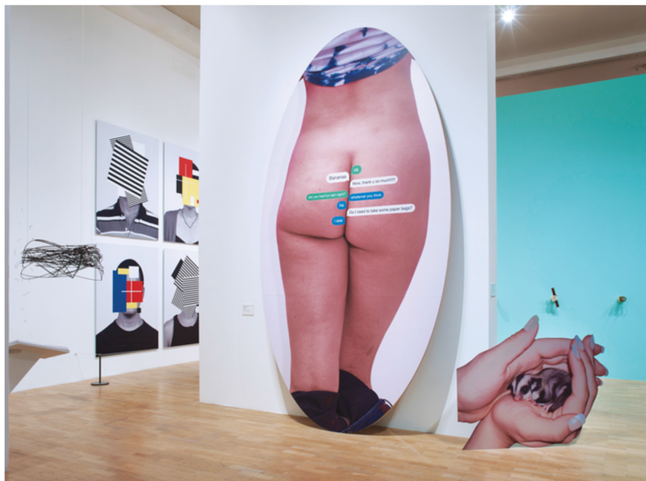
Installation view of “Electronic Superhighway (2016–1966),” 2016.

The curators argued convincingly that E.A.T.’s marrying of then-novel equipment such as video recorders, projectors, and infrared cameras with live performance, dance, and music made it an important precursor to the mixing of disciplines commonplace in art today. This thesis provided something of a through line for the show, a sprawling, euphoric cacophony of artworks across mediums, not unlike the audio-visual bombardment of information we experience daily from television, advertising, and the Internet.