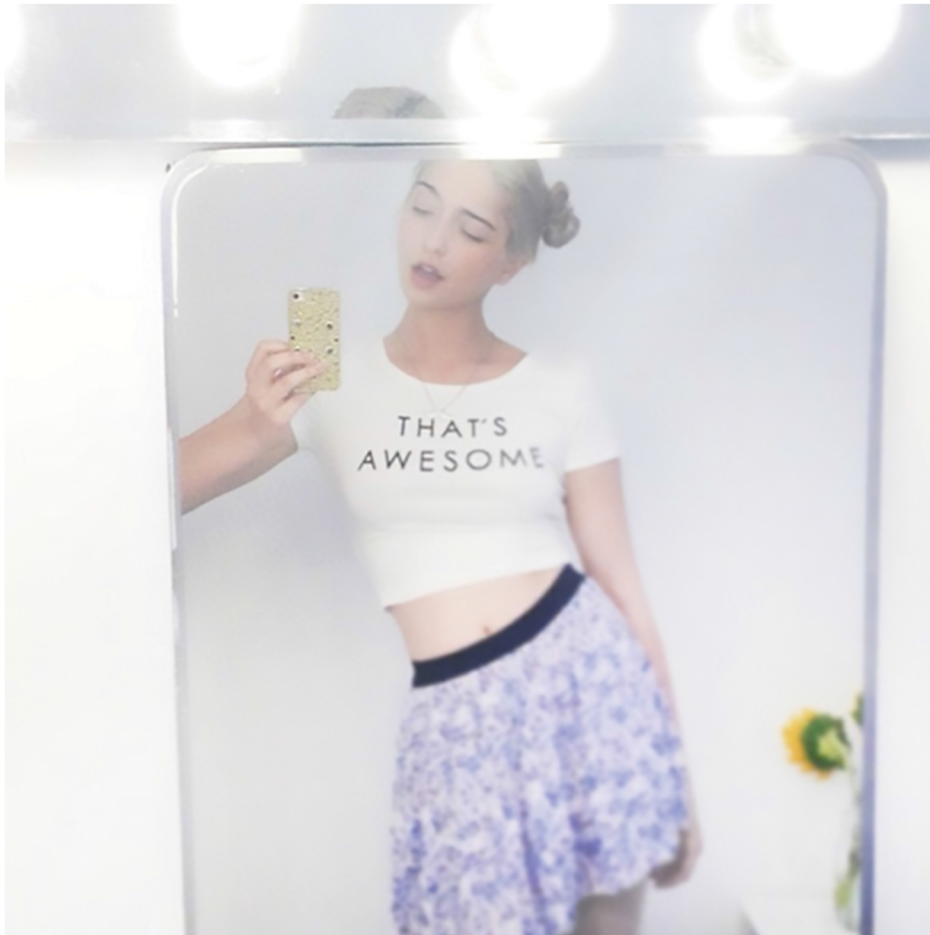
Amalia Ulman, Excellences & Perfections (Instagram Update, 18th June 2014) , 2015, C-type print dry mounted on aluminum, mounted on black edge frame, 49¼" x 49¼" x 1¾".

The exuberance around new technology was especially palpable in Nam June Paik's tele-happening Good Morning, Mr. Orwell , which was broadcast on New Year's Day in 1984 by satellite to New York, Germany, South Korea, and Paris, and was watched by some 25 million people. Featuring artists such as John Cage, Merce Cunningham, Joseph Beuys, and Laurie Anderson, the event, a mash-up of live and pre-recorded material, was a joyous rebuttal of George Orwell's bleak vision of 1984.