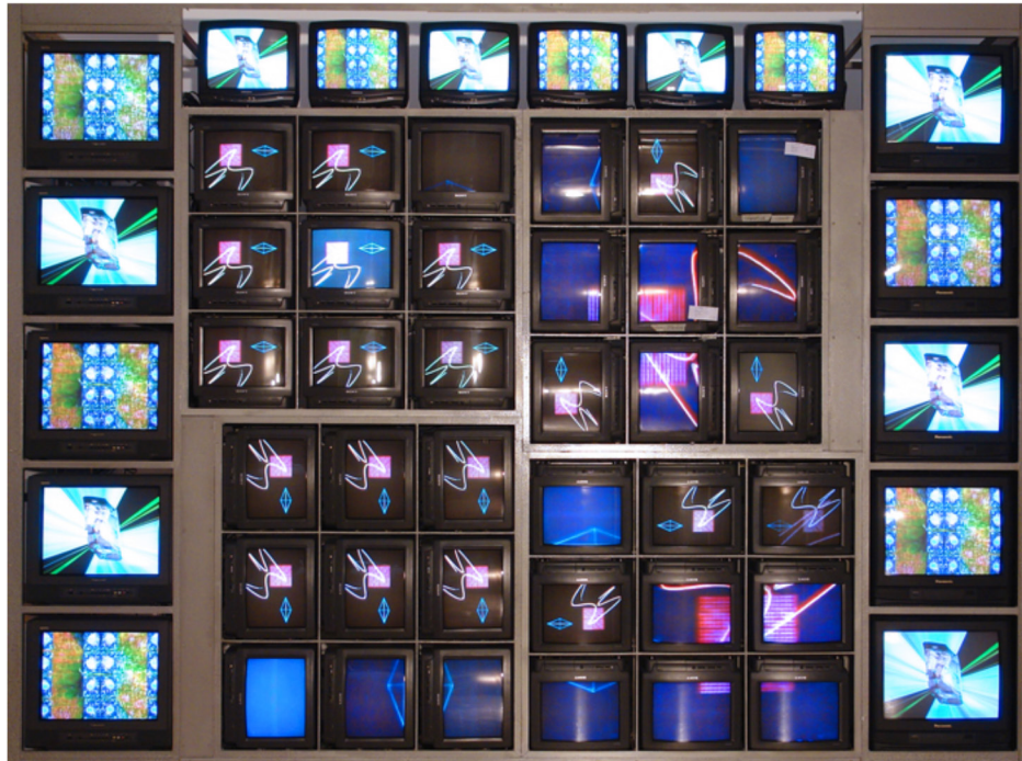
Nam June Paik, Internet Dream , 1994, video sculpture, 113" x 149%" x 31½".