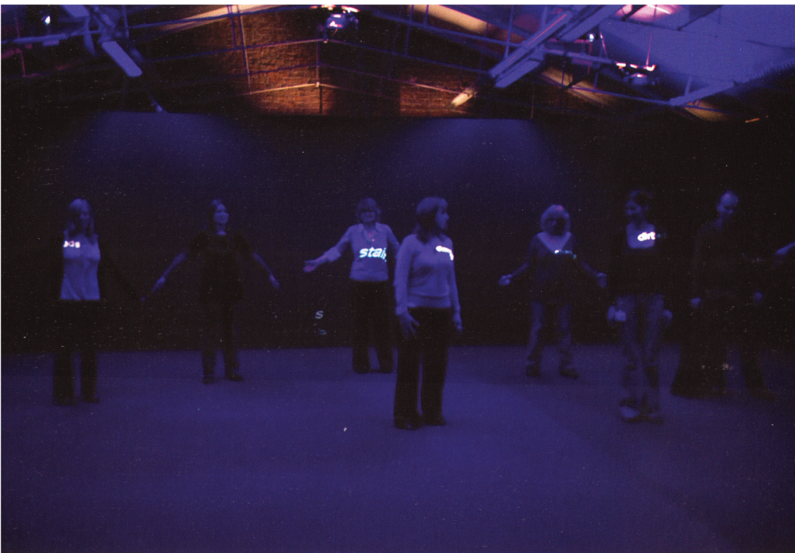
Subtitled Public 2005 Público Subtitulado Mixed media Installation view Tate Liverpool Tate Collection Presented by Lombard Odier Darier Hentsch 2007