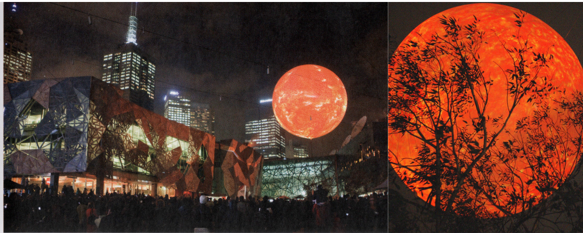
Above and detail: Rafael Lozano-Hemmer, Solar Equation , 2010. Helium balloon, tethers and winches, 5 HD projectors, and 7 computers with custom software, 14 meters diameter. Right, top and bottom: Bruce Munro, CDSea , 2010. Donated CDs, 100 x 100 meters.

of their handheld devices and then watch the “sun” duplicate their designs. Lozano-Hemmer says that his main objective in creating public art installations—usually with projected light—is to turn public spaces into places where people can share experiences. Solar Equation 's engagement and interactivity, as well as its psychologically (if not physically) warming grandeur, gave the people of Melbourne a reason to get outside and enjoy the winter.