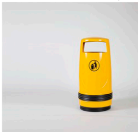
Michael Landy, Self Portrait As Rubbish Bin, 2012.

Sculpture on the Move, 1946-2016, Kunstmuseum Basel until 18 September More than a decade after surveying the history of painting in the 20th century, the Kunstmuseum Basel has staged its curatorial counterpart in three dimensions: Sculpture on the Move . The show inaugurated the museum's new 10,500 sq. m extension, designed by the local architects Christ & Gantenbein, in April. The expanded exhibition galleries trace the journey from the now-classic forms sculpted by the Modern masters Constantin Brancusi and Alberto Giacometti to the avant-garde ephemeral practices—captured here on film—of Gilbert & George, Gordon Matta-Clark and Bruce Nauman in the 1960s and 70s. Head to the Gegenwart building for sculptures from the new millennium by Maurizio Cattelan, Christoph Büchel and Danh Vo, among others. Michael Landy: Out of