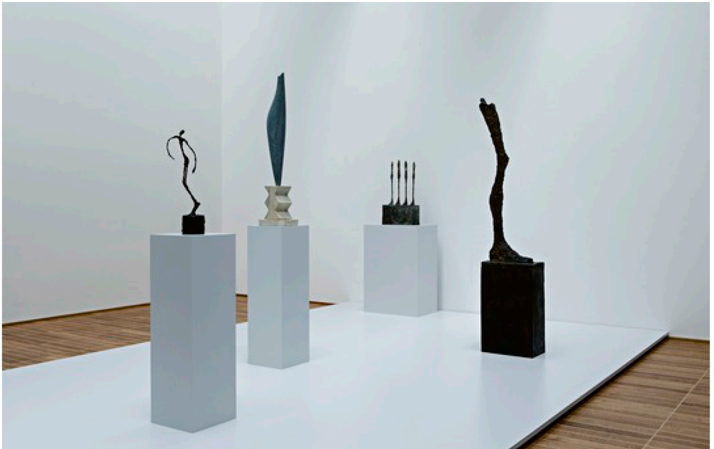
Sculpture on the Move: 1946-2016, in the Kunstmuseum Basel's new extension, opens with works by Constantin Brancusi and Alberto Giacometti.