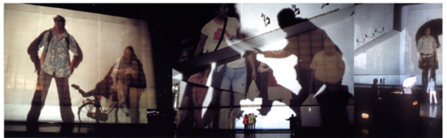
Body Movies, Relational Architecture 6 (Rotterdam, the Netherlands)

These technologies are typically used to perform a pre-programmed commercial monologue, and it's always exciting to exploit them in ways they were not intended. Using projections, robotics, sound, net connections and local sensors, the input and feedback from participants becomes an integral part of the work and the outcome is dictated by their actions.