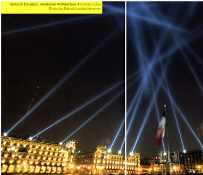
Vectorial Elevation, Relational Architecture 4 (Mexico City)

RLH: There are two main strategies for collective interactivity. The first one I call "taking turns." You have one or two sensors and people take turns using them, and the rest are spectators. Examples include Jeffrey Shaw's Eve , where one person controls the point of view of a virtual world projected on a large dome; Toni Dove and Michael Mackenzie's Archaeology of a Mother Tongue , where a tracking glove is used to navigate a narrative; and our Displaced Emperors , where a participant wears a tracking system to transform the Linzer Castle. The other popular strategy for collective interactivity I call "taking averages." This is what you have in interactive cinema experiences and in game shows: a voting interface where input is statistically computed and the majority directs the outcome. This can be very frustrating and democratic; it makes you feel that your