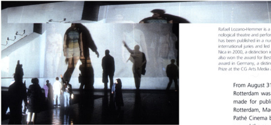
Body Movies, Relational Architecture 6 (Rotterdam, the Netherlands)