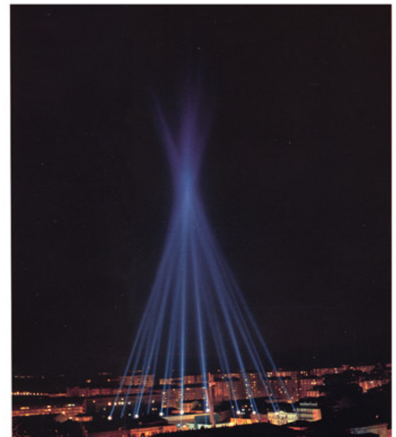
Vectorial Elevation, Relational Architecture 4 (Vitoria-Gasteiz, Basque Country, Spain) Photo by David Quintas

of experience. The planes may be very different, but sometimes a small connection is made, either locally or temporarily or post-geographically. There's always seepage between the different levels. We all live in relational space and time. For me the emphasis isn't on the fetish of the structure, on what is top and what is down; it's more on the interconnection, the relationship between two things, between our experience and the outside world of constructed, consensual, sensory experience, if it exists at all. For me, what is important is where these worlds meet.