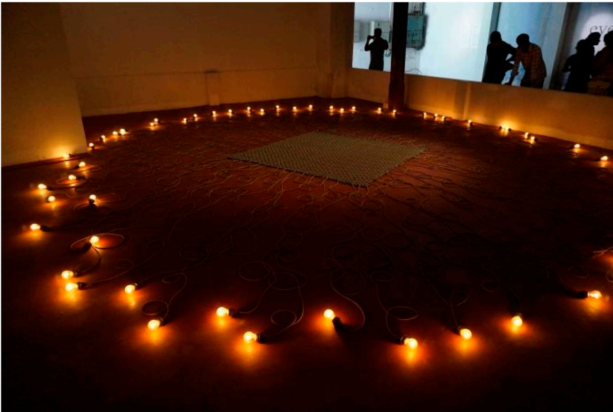
IMAGE: MONA HATOUM'S WORK UNDERCURRENT AT THE KOCHI-MUZIRIS BIENNALE