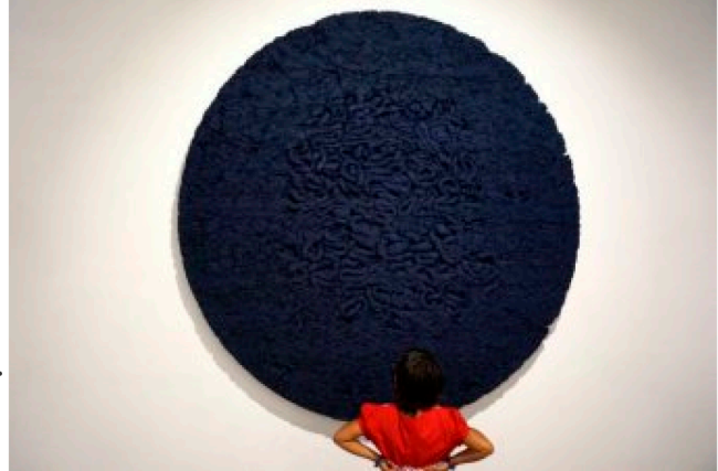
IMAGE: A GIRL CONTEMPLATES AN ARTWORK AT THE KOCHI-MUZIRIS BIENNALE

From the fourteenth century, Kochi was an important spice trading centre, and from the sixteenth century was occupied successively by the Portuguese, the Dutch and the British. In 2012, Kochi became home to India's very first contemporary art biennale, the Kochi-Muziris Biennale.