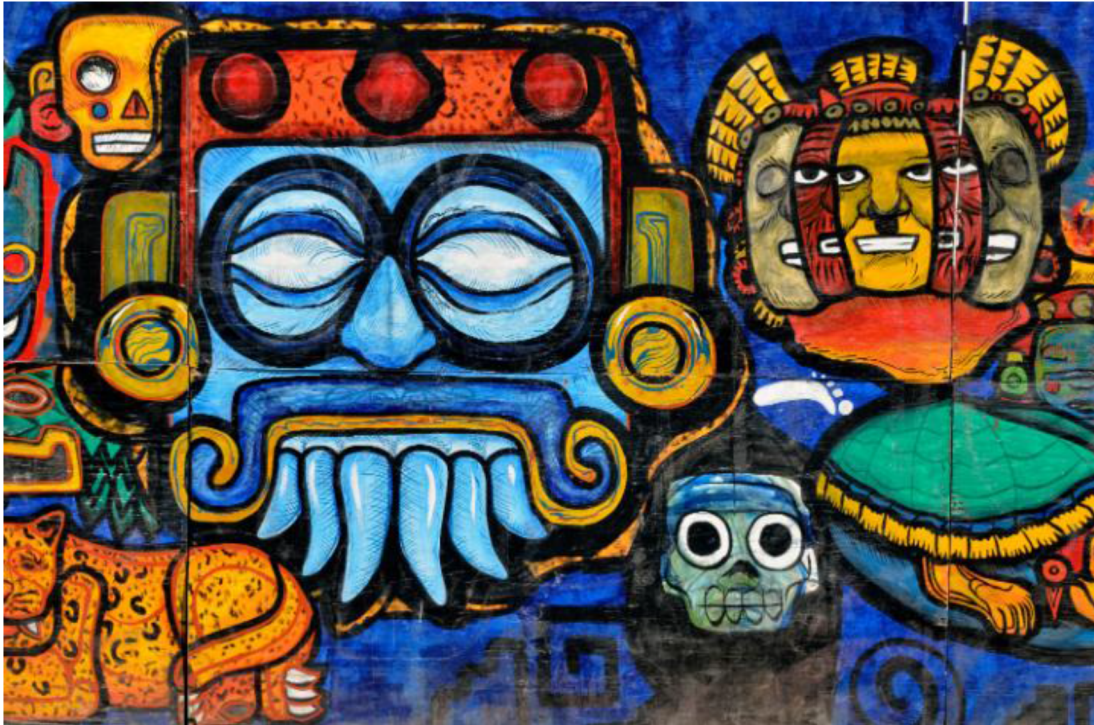
Graffiti painting on a hoarding, Mexico City