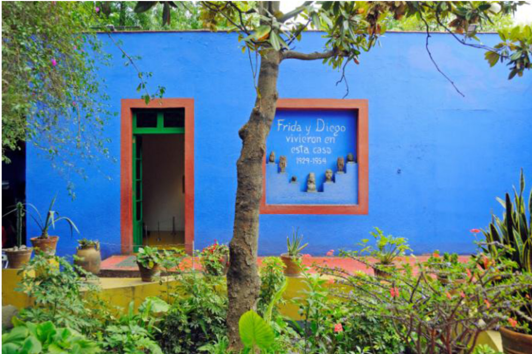
Casa Azul, Frida Kahlo's home