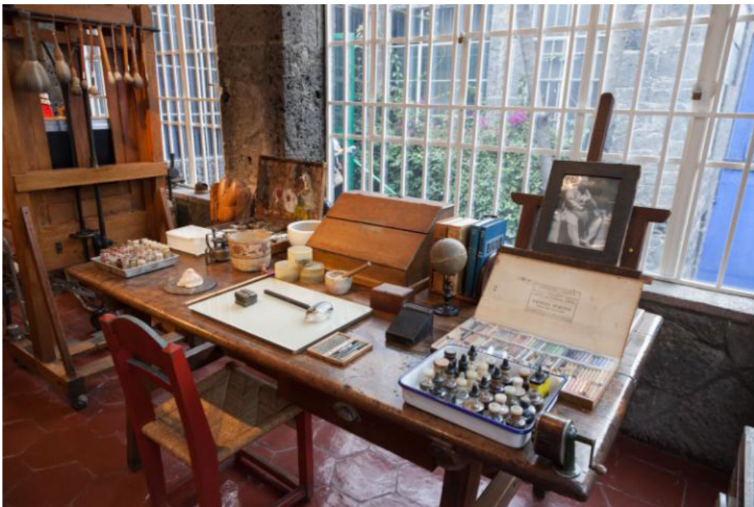
Frida Kahlo's studio in Casa Azul