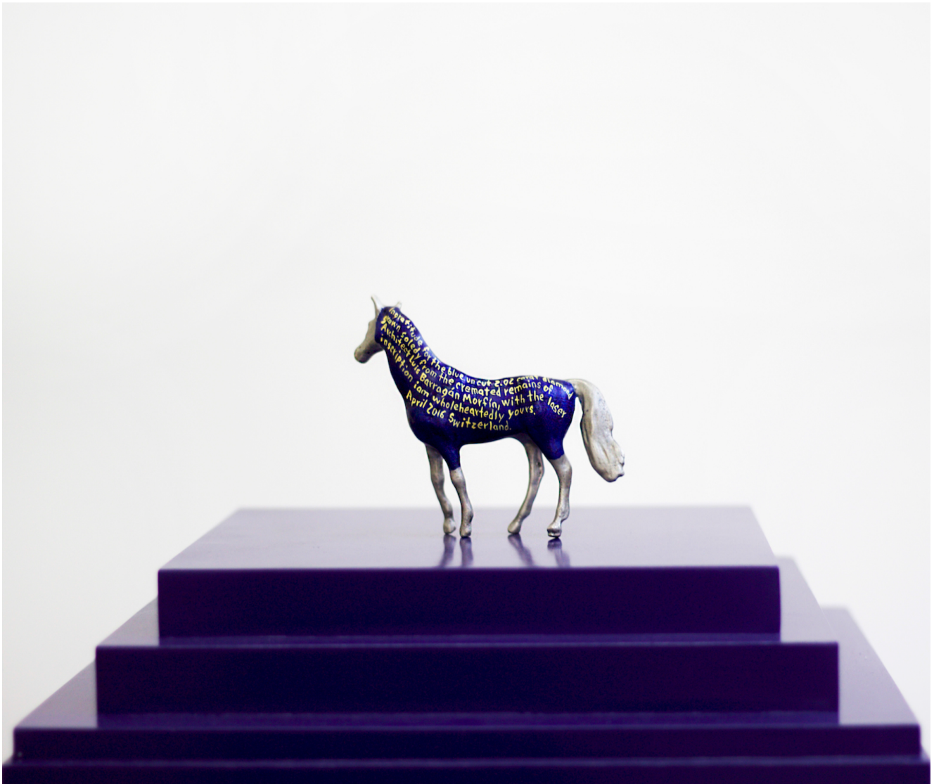
Jill Magid, “Ex-Voto: Miracle of the Diamond” (2016) (click to enlarge)

The exhibition at the Kunst Halle Sankt Gallen in Switzerland, The Proposal , was just that. By extension, the show in Mexico City is also a stage for potential action, which becomes performative when the artist reads her proposal to Zanco aloud in the exhibition space. “I don’t see the exhibition as an artifact,” she said. Nevertheless, through the exhumation of the