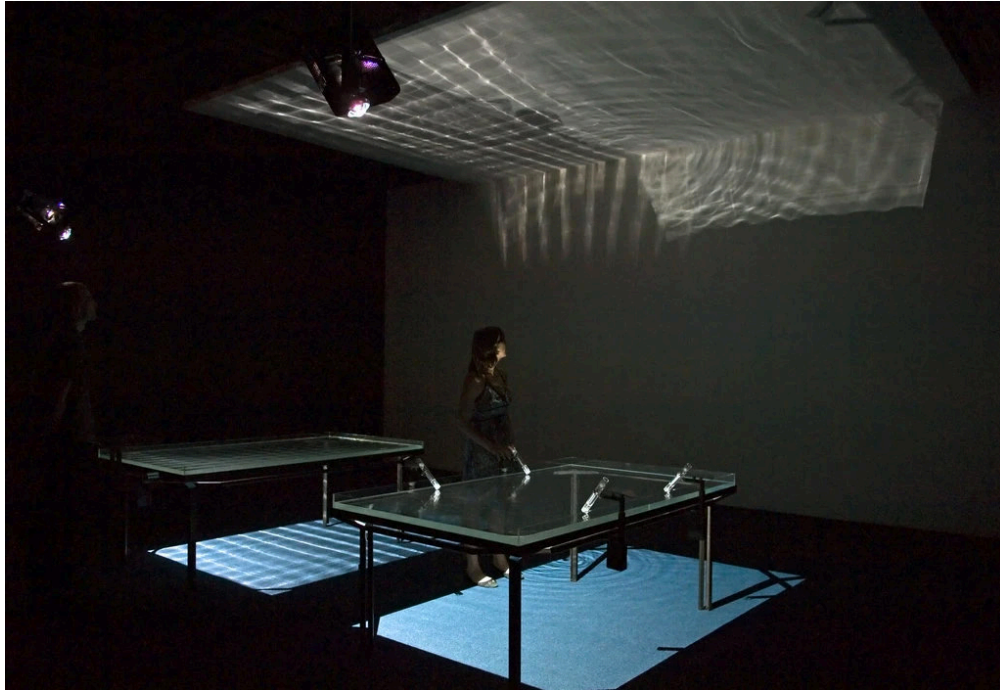
Mr. Lozano-Hemmer's "Pulse Tank," 2008, installed at the New Orleans Museum of Art.