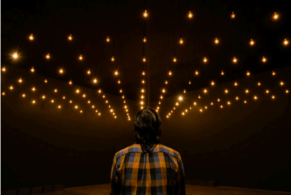
The “Pulse Room” at the MUAC Museum, Mexico City, in 2015.

“And I’m the director, but I credit them, as you would credit your composer and your lighting designer on a film,” he said.