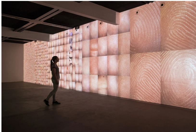
Mr. Lozano-Hemmer's "Pulse Index," 2010, at Haus der Elektronischen Künste Basel, Basel, Switzerland, in 2016.

"It's absolutely disgusting," Mr. Lozano-Hemmer said recently, not something frequently heard from, say, Picasso about his latest canvas.