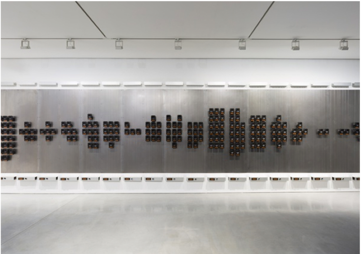
Rafael Lozano-Hemmer - Pan-Anthem, 2014

In Pan-Anthem (2014) hundreds of national anthems are poised to play, upon the approach of the viewer. Individual movable speakers are magnetically fixed across the wall at the front of the gallery, precisely arranged to visualise a set of national statistics: whether population, GDP, land mass, year of independence, or percentage of women in parliament, to name a few possible arrangements. For example, at the gallery the work is configured to show the spread of national military spending per capita, on the far left of the wall the public can hear the anthems of countries without military forces like Costa Rica, Grenada and Andorra. As they walk to the right, they are able to hear India 2.5 m away, then China 5 m away, the Canadian Anthem plays at 6.5 m, Russia at 7 m, UK at 7.5 m and finally the United States' 'Star Spangled Banner' plays with the anthems of Israel, UAE, and Saudi Arabia at the far right of the room, 8 m away. As a visitor approaches a particular set of speakers, these start playing automatically, creating a positional panoramic playback of anthems associated to specific metrics.