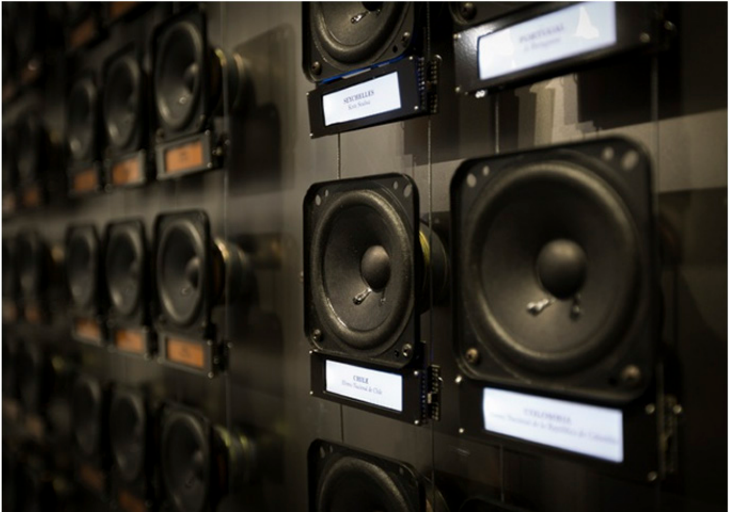
Rafael Lozano-Hemmer - Pan-Anthem, 2014

Previous Lozano-Hemmer sound installations include the recent public art installation Voice Tunnel (2013) where participants used their voice to transform seven city blocks of the Park Avenue Tunnel in New York City ; the memorial for the Tlatelolco student massacre in Mexico City entitled Voz Alta (2008); and the radio electric scanning shadow-play Frequency and Volume (2003) installed at the Venice and Singapore Biennales, the Curve at the Barbican, Louisiana Museum in Denmark and the National Taiwan Museum of Fine Arts.