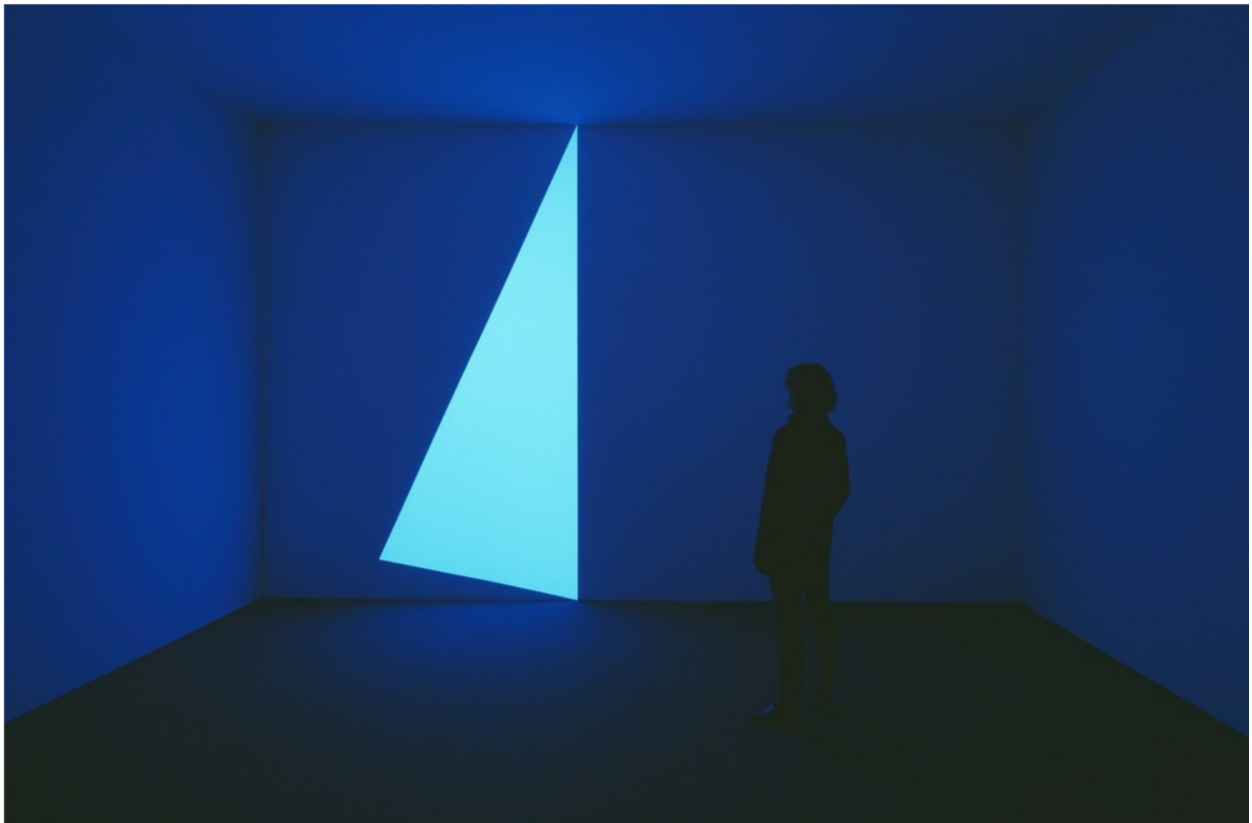
Installation view of “James Turrell: 67 68 69” at Pace Gallery.

ARTSY EDITORIAL BY RACHEL LEBOWITZ MAR 31ST, 2017 10:28 PM