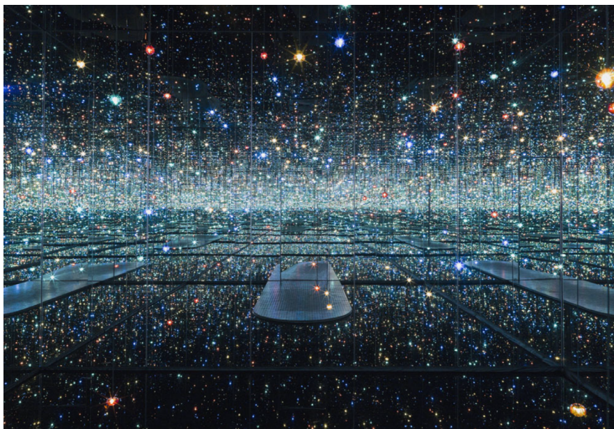
Yayoi Kusama Infinity Mirrored Room - The Souls of Millions of Light Years Away , 2013 "The Inaugural Installation" at The Broad, Los Angeles