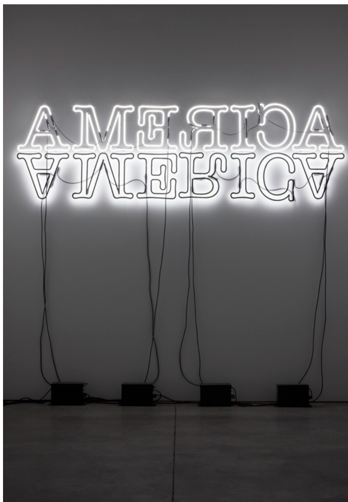
Glenn Ligon, Double America, 2012.