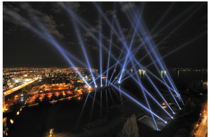
Rafael Lozano-Hemmer Vectorial Elevation , 1999-2010 bitforms gallery

Technology and participation are both key elements of Lozano-Hemmer's practice. One of his earlier works, Vectorial Elevation (1999), allowed anyone with an internet connection to control 18 searchlights that the artist had installed on buildings surrounding Mexico City's main square. Over the following decade, iterations of the project took place in Spain, France, and Ireland, as well as in Vancouver during the 2010 Olympic Games.