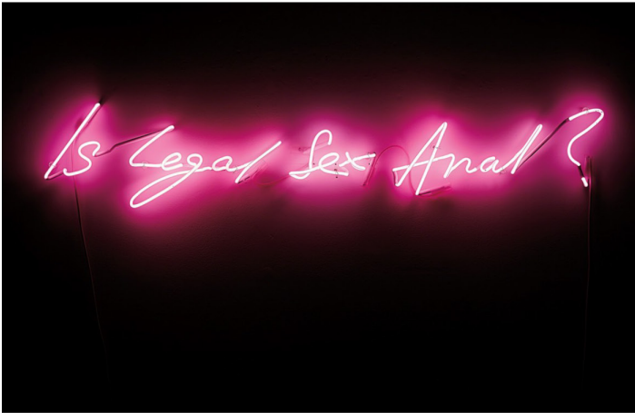
Tracey Emin Is Legal Sex Anal? , 1998 Phillips 20th Century and Contemporary Art Day Sale (J...