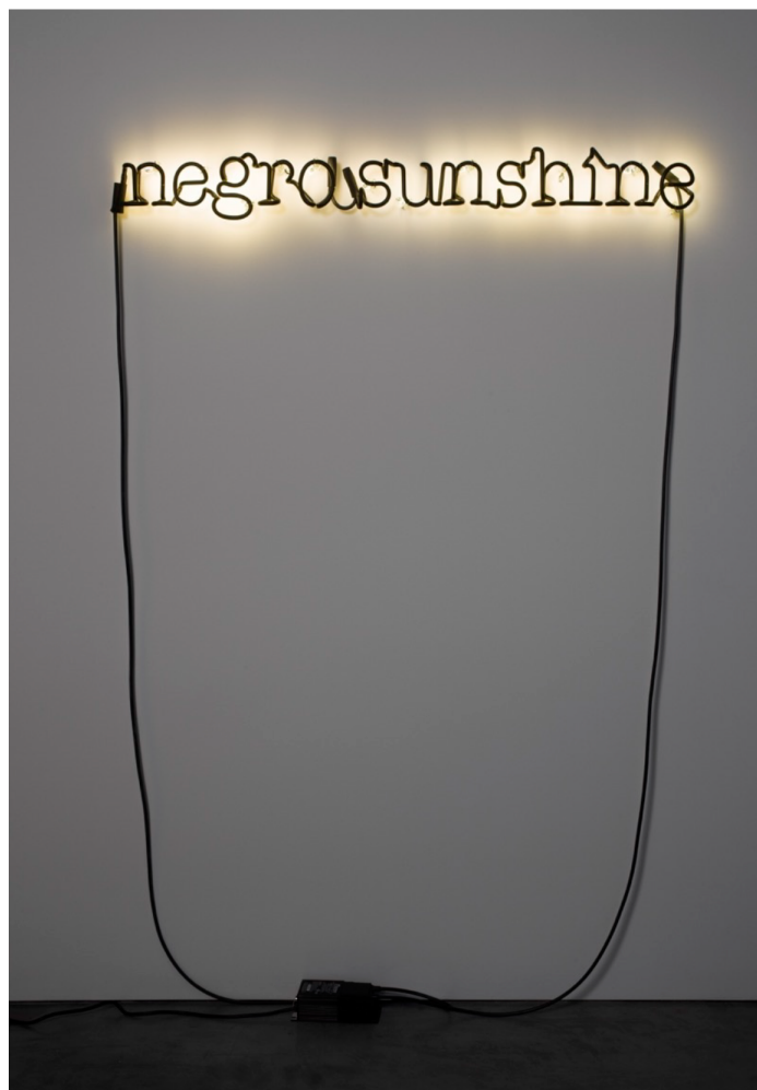
Glenn Ligon, Warm Broad Glow, 2005.