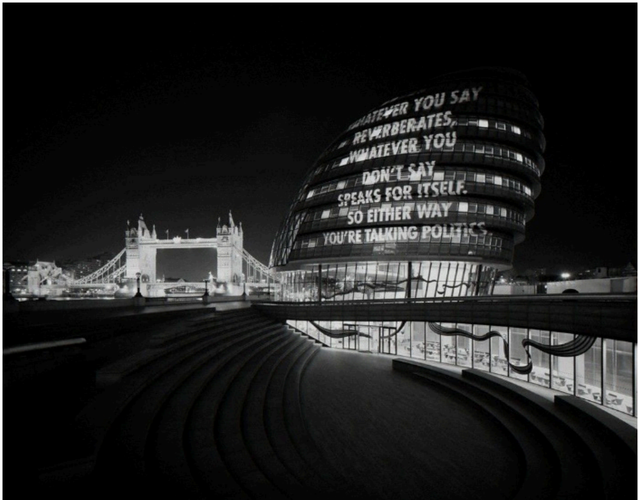
Jenny Holzer TALKING POLITICS , 2008 Kukje Gallery