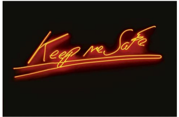
Tracey Emin KEEP ME SAFE , 2006 New Art Projects

Queen of the YBAs, London-born Emin creates feminist-leaning works that range widely in medium, but which are steadfast in their subject matter: her own personal life. In installations, she has shown the world her unmade bed and publicized the names of all her past sexual partners, creating works that are as brazen as they are vulnerable.