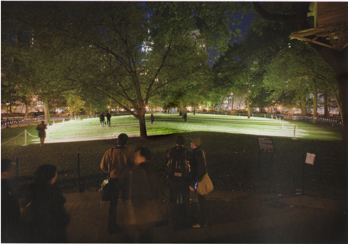
Pulse Park, Relational Architecture 14, 2008. Heart-rate sensor, computer, DMX controller, custom software, dimmer rack, 200 Source Four spotlights, and generator, lawn: 80 x 60 meters. 2 views of work in Madison Square Park, New York.

light that blinds you, the light of explosions, light made up of schizoid photons that are neither particle nor wave, or perhaps both.