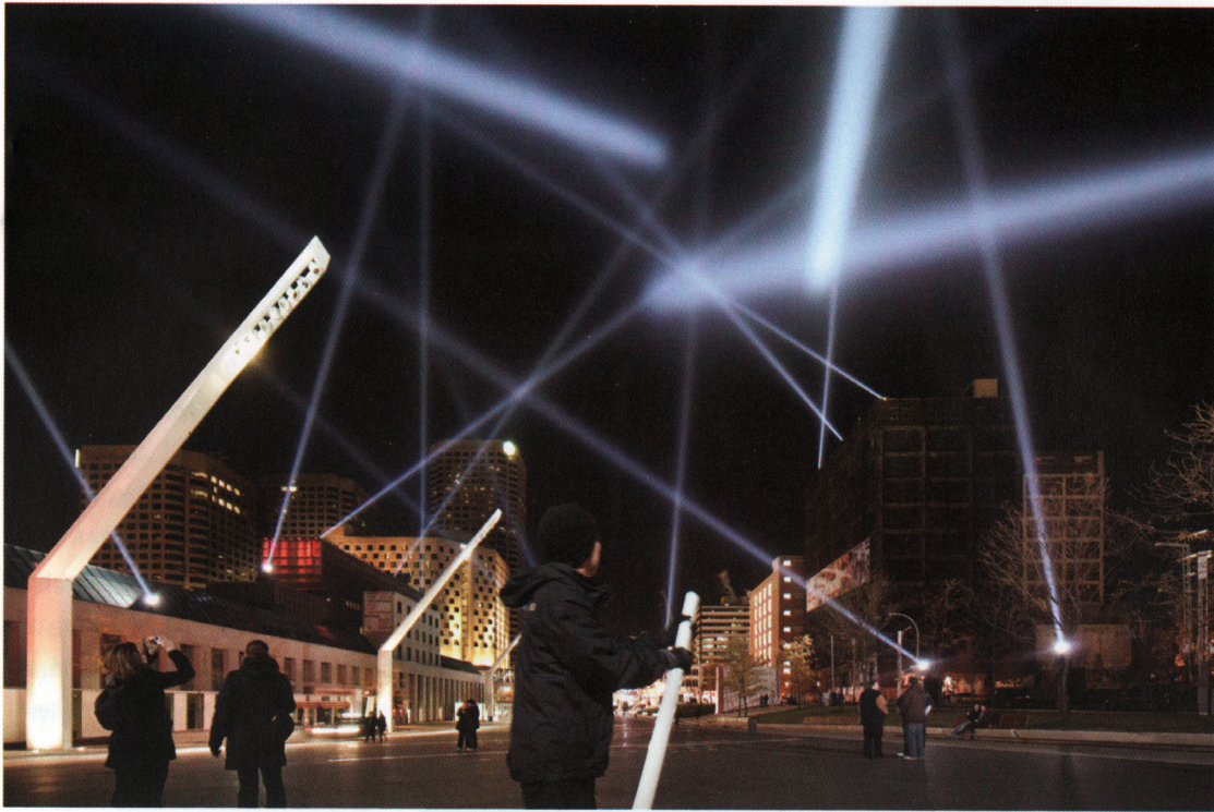
Articulated Intersect, Relational Architecture 19, 2011. Custom-built haptic levers, computers, searchlights, and DMX distribution, dimensions variable. View of work at the Triennale Québécoise, Musée d'art contemporain de Montréal.

of police control, you are police control. That doesn't mean you can't do it, it just means that you know that you're complicit. You know that developing tracking systems, which my studio does, feeds a vicious circle. The futility of what I do gives it the freedom to be transgressive.