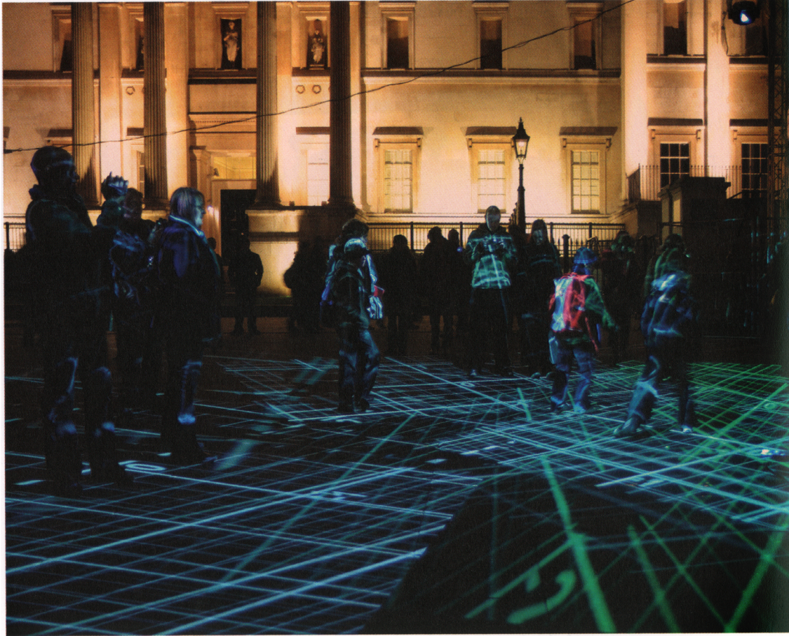
Under Scan, Relational Architecture 11, 2008. Robotic projectors, media servers, Pani 12kW projectors, scissor lifts, computerized surveillance system, and custom software, dimensions variable. View of work in Trafalgar Square, London.

RLH: I love that — “platform” gives too much emphasis to the actual stage, but “rehearsal” shifts the focus to the people and recasts the work more performatively. These interruptions, or rehearsal spaces, are community building. Some of the metrics at work in assessing the global city are quite problematic because they systematize all of the city’s functions into very specific datascares, mostly fed through surveillance. The democratic potential of public space is premised on heterogeneity. That prerequisite is disappearing — not only in traditional public space, but also in new public spaces such as the Internet. The public space of the electromagnetic spectrum is similarly besieged. For instance, if I want to distribute my content through the iTunes store, I need to have Apple’s permission. Corporatization is at work not just in physical city spaces, but also in virtual, symbolic, and communicational spaces.