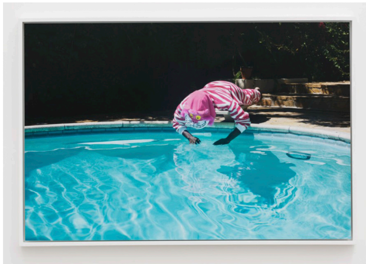
Jen DeNike, The Cat , 2015, 8:08 minutes.

There is no shortage of humor in “Love, Devotion, and Surrender,” but it isn’t always delivered in an easy form. With his usual gonzo wit, Tony Oursler serves up Invisible Green Link , a 2007 wall piece from his series Ooze . Here, a communicative, bloodshot eye stares out with a look of—is it judgment? desperation?—from a 2-D green blob, watching us watching it watching us watching it. Jen DeNike’s The Cat (2015) is the mesmerizing, if perplexing, adventure of a man in a red-and-white-striped cat costume cavorting balletically by a series of turquoise swimming pools.