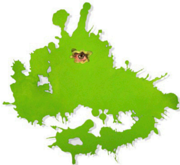
Tony Oursler, Invisible Green Link , 2007; aluminum, acrylic, LCD screen, DVD player, approx. 57 by 61 by 4½ inches.

Bill Viola's 2005 Becoming Light falls squarely in the romantic category: a male and a female swimmer embrace in slow motion, suspended like heavenly bodies in a universe of blue water, eventually coalescing into a single orb and disappearing together. In the context of this show, Petra Cortright's tiny video charmer, Sparkling 2 (2010)—displayed on a cellphone screen—takes on a super-intimate, possibly even onanistic aura: over the course of about a minute, the artist prances on the miniature screen, waving a tree branch that sends off digitally effected glitter. Mexican-Canadian artist Rafael Lozano-Hemmer likewise shows off some digital prowess with his interactive 2008 work Making Out . Displayed on a screen with a built-in tracking system are hundreds of squares, each showing a couple gazing at one another; when the viewer stands or moves in front of the display the couples shift and kiss.