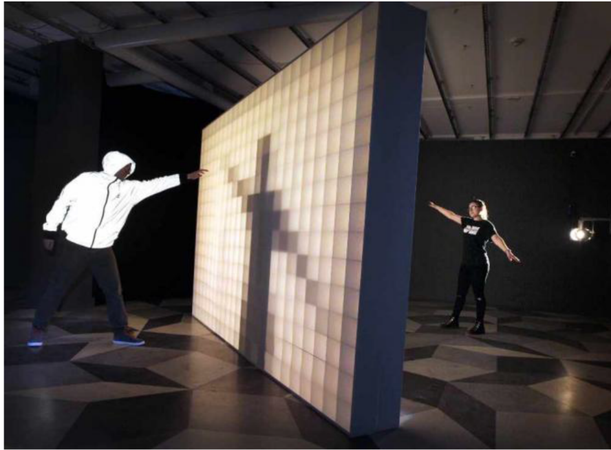
0,16 Installation View