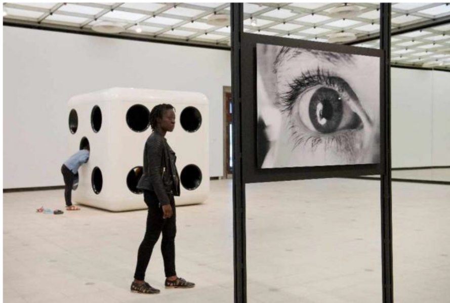
Carsten Höller, Dice

2015 is a record year for exhibitions that push the boundaries of art and visitor experience, with participation and interaction key aspects to these shows. Solo and group exhibitions, intriguing installations and curious technologies are attracting numerous visitors worldwide. From hyper-realistic sculptures in London , to interactive installations in Dublin , to cutting-edge media works in New York , here is a list of the top ten exhibitions you need to attend before this year is out.