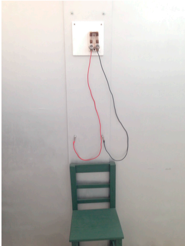
Installation view of Grupo Proceso Pentágono's "Pentágono" at MUAC

The retrospective of works by Grupo Proceso Pentágono, on display at the Museo Universitario de Arte Contemporáneo (MUAC) in Mexico City, addresses a gap in our historical memory. Investigations of the period known in Mexico as la guerra sucia , or the dirty war, did not begin until the Institutional Revolutionary Party (PRI) lost power in 2000, and the story remains largely forgotten. During the 1950s, '60s, and '70s, the Mexican government violently repressed a series of protest movements, killing students and activists, and striking railroad workers. Many Mexican dissident groups decided to take up arms, and the government responded with forced disappearances, arrests of family members, and torture of men, women, guerrillas, and those suspected of supporting them. In 1968, on the eve of the Olympics, the Mexican army killed several hundreds of student protestors in Mexico City. In 1971, a paramilitary group affiliated with the government perpetrated another student massacre in the capital. These crimes went unpunished, and mostly unmentioned. But it is hard to imagine a more strident, dramatic denunciation than the collection of works on display by Grupo Proceso Pentágono, active from 1976–1985, who turned their art into political intervention.