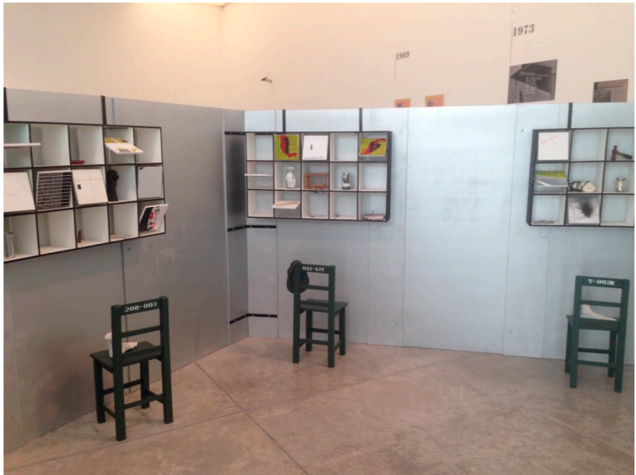
Installation view of 'Proceso Pentágono Group'

Replicas of some of Proceso Pentágono's most important works are on display at MUAC. One piece from 1979, "1929: Proceso," a reference to the 50th anniversary of the founding of Mexico's ruling political party, recreates a police-station torture center. At the door, posters show photos of desaparecidos . The viewer walks through several very disturbing rooms — coming across surveys with questions about real cases that reveal who was abducted where, when, and by whom — before finding a trove of testimonies written by victims who were tortured by government forces.