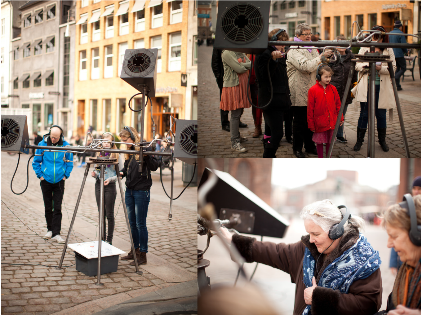
Figure 6. Different forms of interaction and listening.

disjunctive synthetic operations for constituting immediate and at the same time fielding events of experience. The way an entire urban media ecology shifts in its potential through an embodied and affectively engaging process enables us to think such technologies as technologies for emergent experience. At the same time, considerations for emergence have to be complemented with the processes of perishing and its extension of a field of experience, its virtual structuration. The main challenge is not only to make things felt in their immediate presence in experience but also to make their potential ways of causation or continuation a vital and empowering part of it.