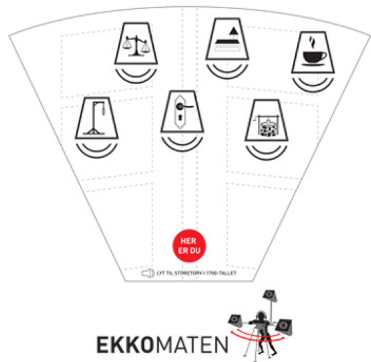
Figure 5. Ekkomaten and a map showing the layout of the square, with symbols for the position of each of the six echoes that people could search for. Graphics by: Jette Bæk Møller.