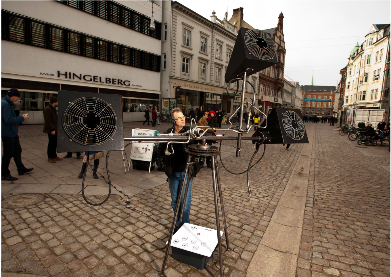
Figure 4. Ekkomaten, on display at Store Torv, Aarhus in March 2012.