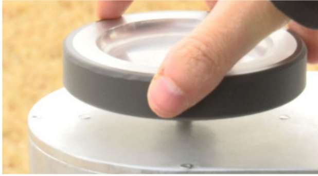
By turning the dial you can move the lights.

border is all about,” said Rafael Lozano-Hemmer the Artist of Border Tuner.