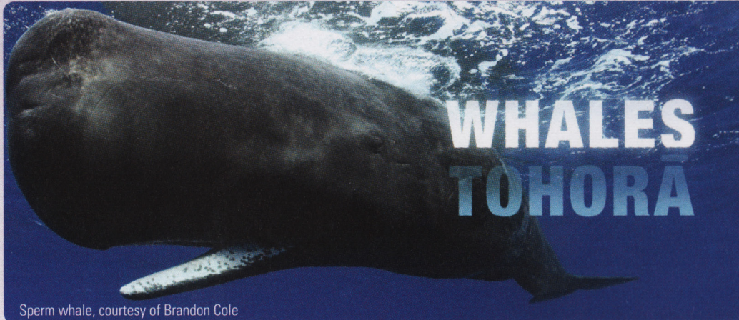
Sperm whale