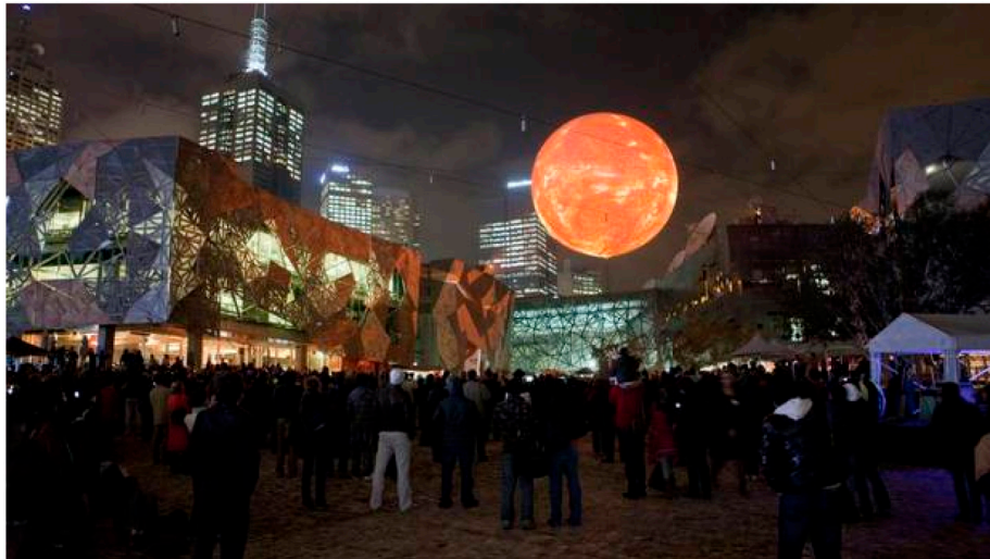
Rafael Lozano-Hemmer's 'Solar Equation' is an example of his passion for works that serve as 'platforms for public participation.'