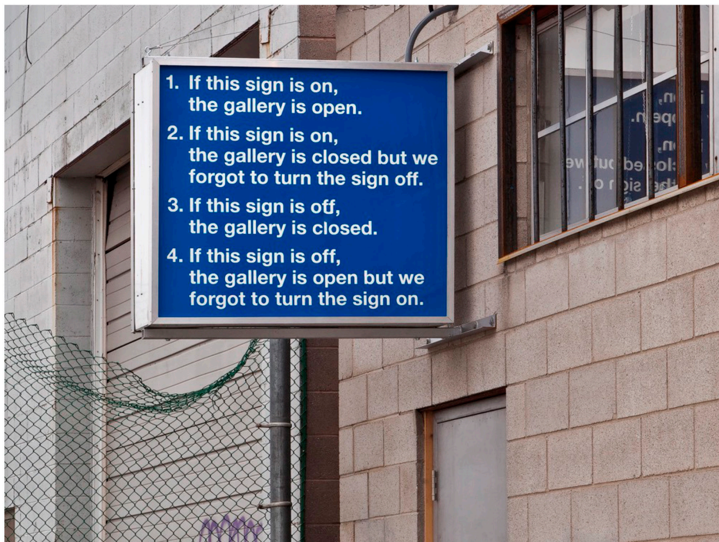
Micah Lexier, This Sign (2011, illuminated commercial sign, 96.52 x 109.22 x 30.48 cm.)