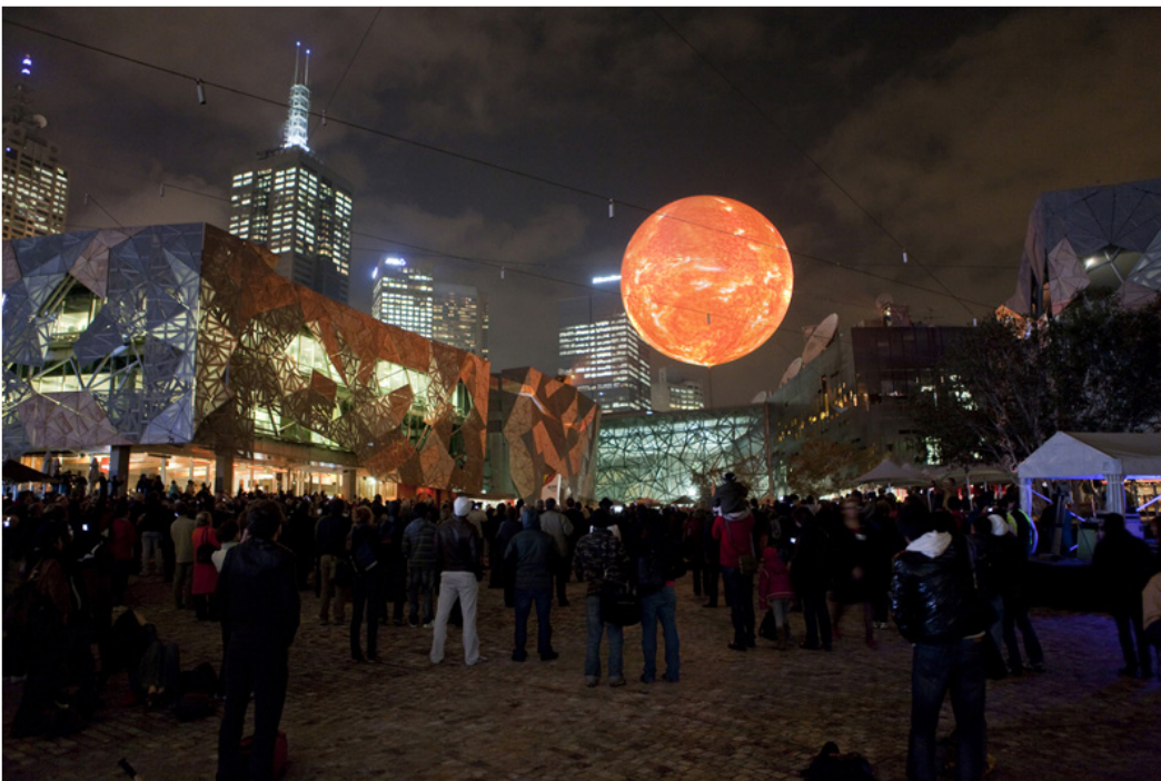
Rafael Lozano-Hemmer, Solar Equation , 2010, spherical captive balloon, helium, tethers and winches, 5 HD projectors, 7 computers with custom-made software, wifi network, iOS app., dimensions: 14 m diameter. Commissioned by Federation Square (Melbourne).