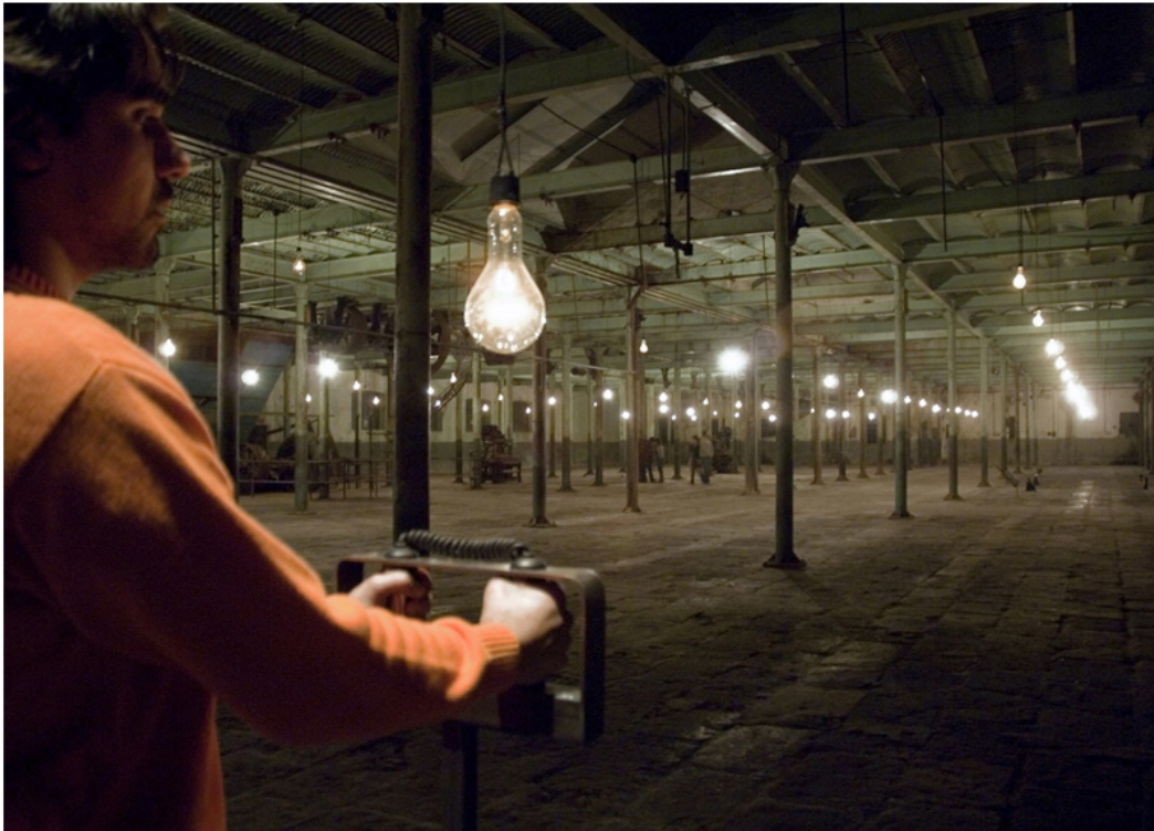
Rafael Lozano-Hemmer, Pulse Room , 2006, light bulbs, voltage controllers, heart rate sensors, computer and metal stand, variable dimensions. Collections: MoMA (NYC), Musée d'art contemporain (Montréal), Museum of 21C Art (Kanazawa), Museum of Old and New Art (Hobart).