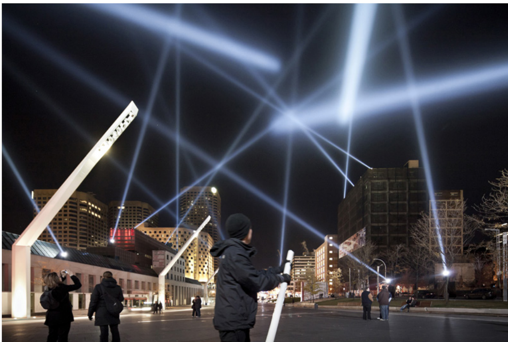
Rafael Lozano-Hemmer, Articulated Intersect , 2011, Custom-built haptic levers, computers, searchlights, dmx distribution. Variable dimensions. Collection: Musée d'art contemporain (Montréal).