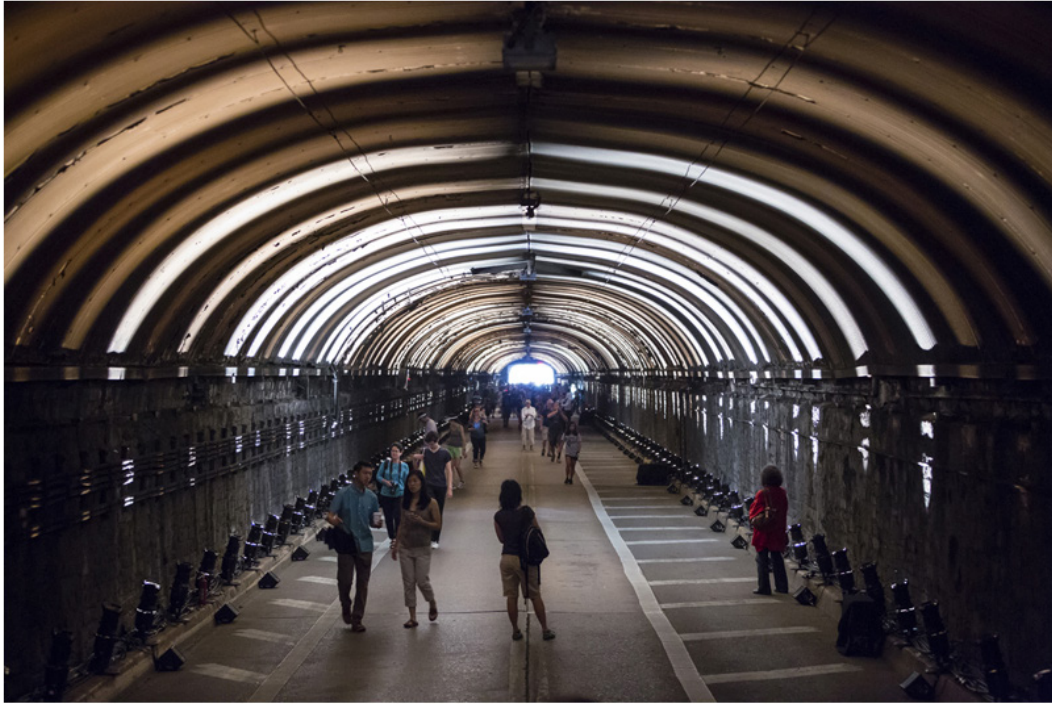
Rafael Lozano-Hemmer, Voice Tunnel , 2013, Custom-software, 300 x 750W source four spotlights, ETC dimmer racks, speakers, computers, 35 km of Socapex power cable, 4 km of fiber optic cable, 3 km of XLR cable, 4 generators each supplying 500 Amps, microphone, custom hardware, variable dimensions. Commissioned by DOT for Park Avenue Tunnel (NYC).