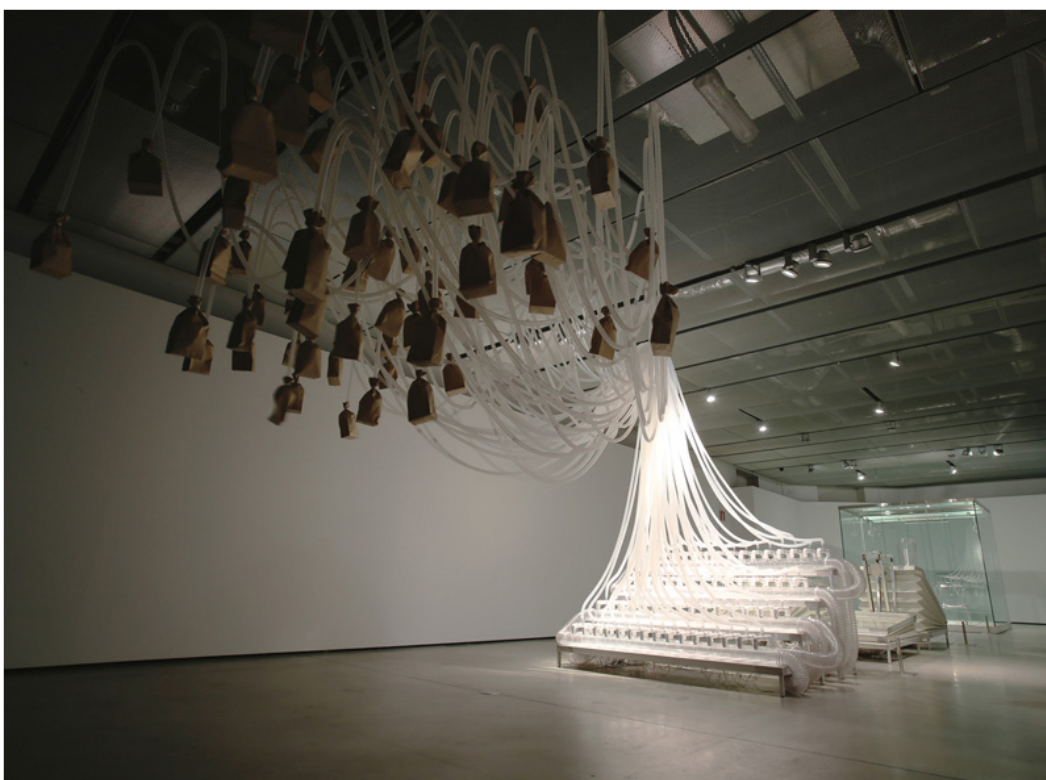
Rafael Lozano-Hemmer, Vicious Circular Breathing , 2013, sealed glass prism with automated sliding door system, motorized bellows, electromagnetic valve manifold, 61 brown paper bags, custom circuitry, respiration tubing, sensors, computer. Variable dimensions. Collection: Borusan Contemporary (Istanbul).