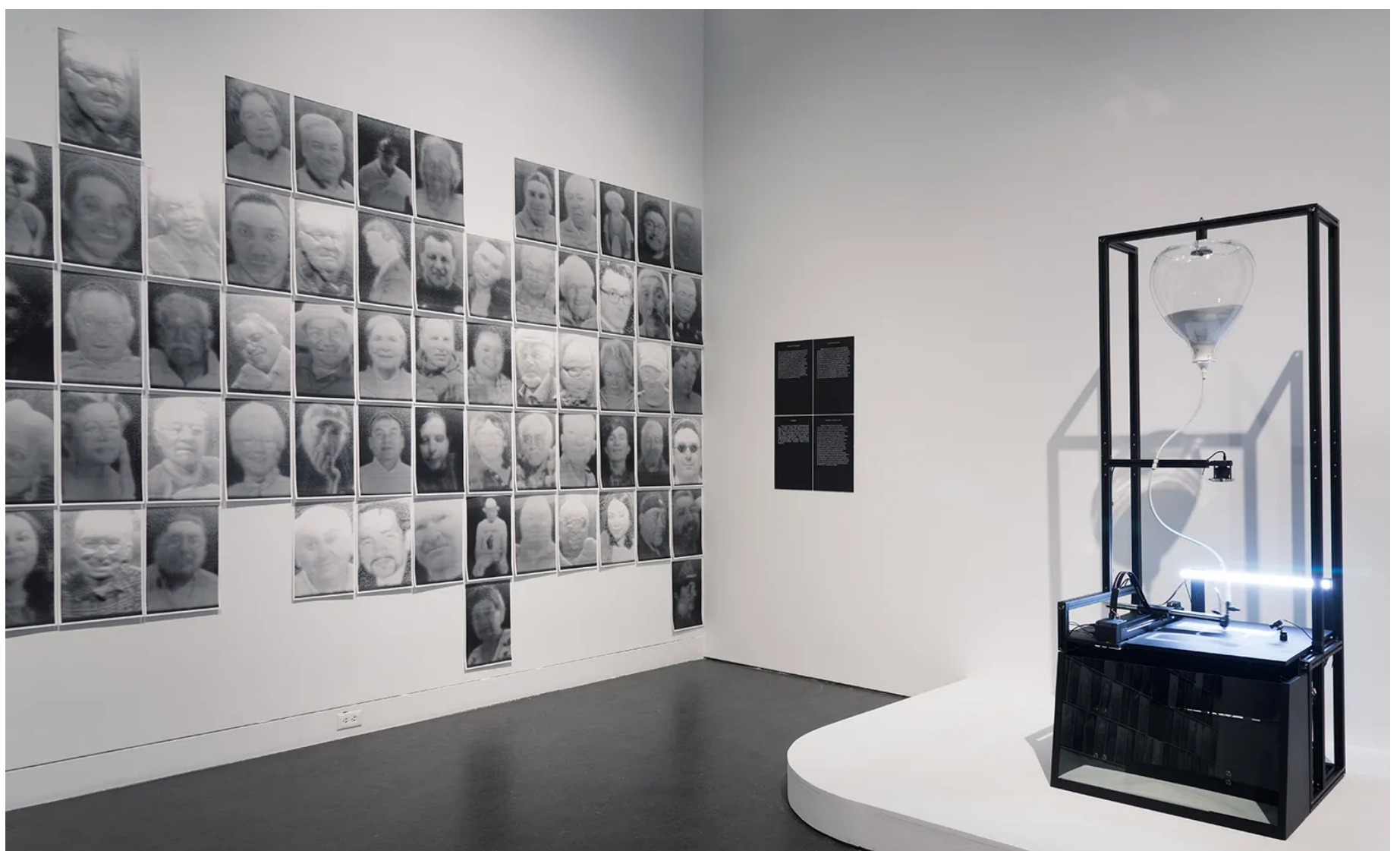
Installation view of Raphael Lozano-Hemmer, A Crack in the Hourglass, An Ongoing Covid-19 Memorial , at the Brooklyn Museum until 26 June 2022