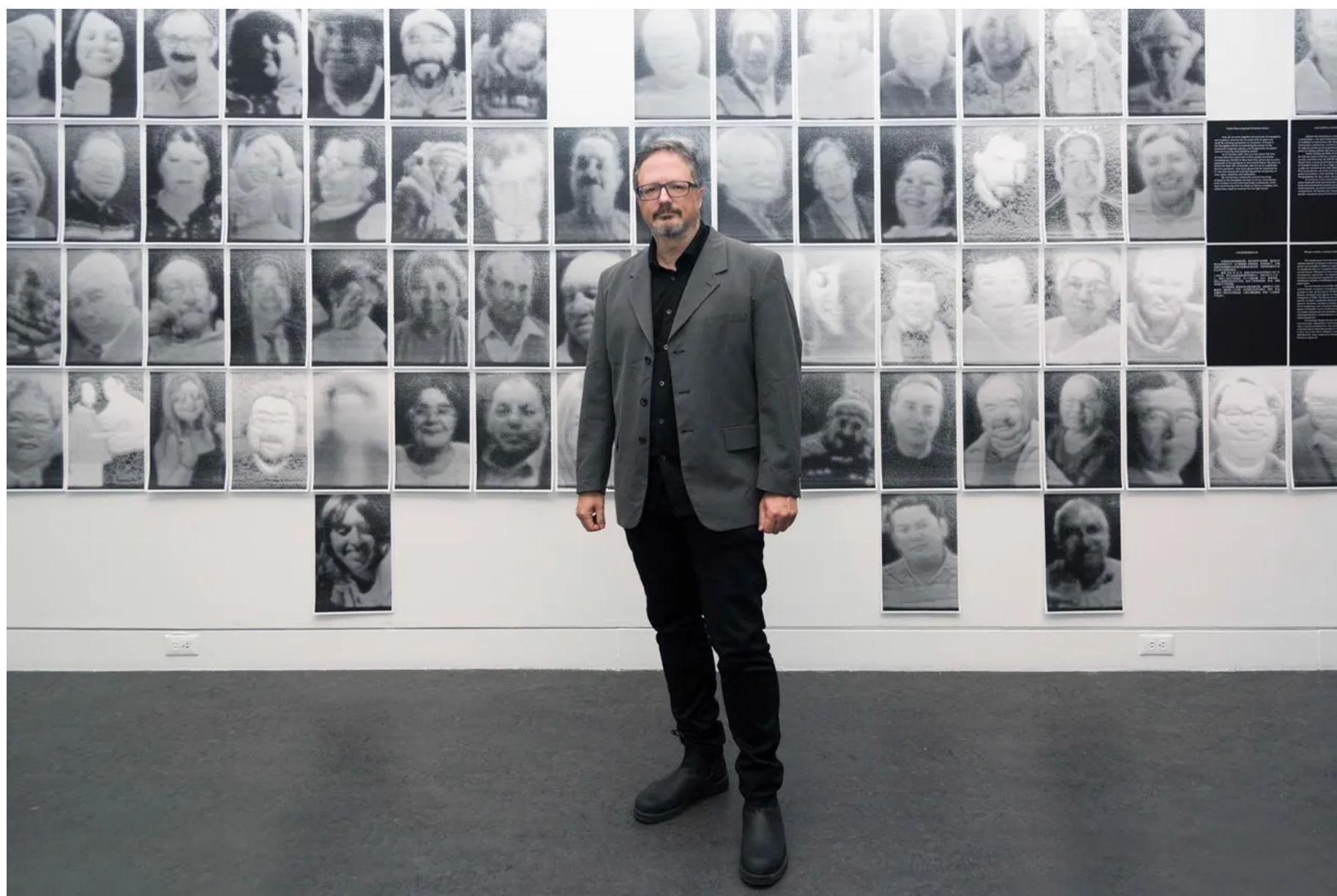
Raphael Lozano-Hemmer at the Brooklyn Museum. 'A Crack in the Hourglass, An Ongoing Covid-19 Memorial', until 26 June 2022.

'This project is designed for mourning our losses at a time when we have been socially distant and denied proximity to those affected. The piece also represents continuity, as the same sand is used to make an endless number of unique portraits,' says Lozano-Hemmer, who is known for provocative indoor and outdoor art installations on the intersection of technology, architecture, performance, and public art. 'I am very eager to see how the project is received in New York City, an epicentre of the pandemic, and am thankful to the Brooklyn Museum for bringing it to the United States.'