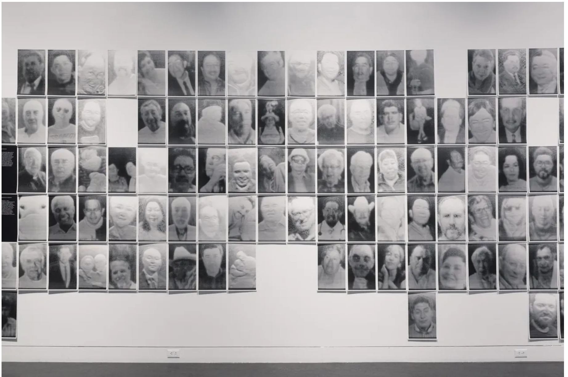
Top and above: installation view of Raphael Lozano-Hemmer, A Crack in the Hourglass, An Ongoing Covid-19 Memorial, at the Brooklyn Museum