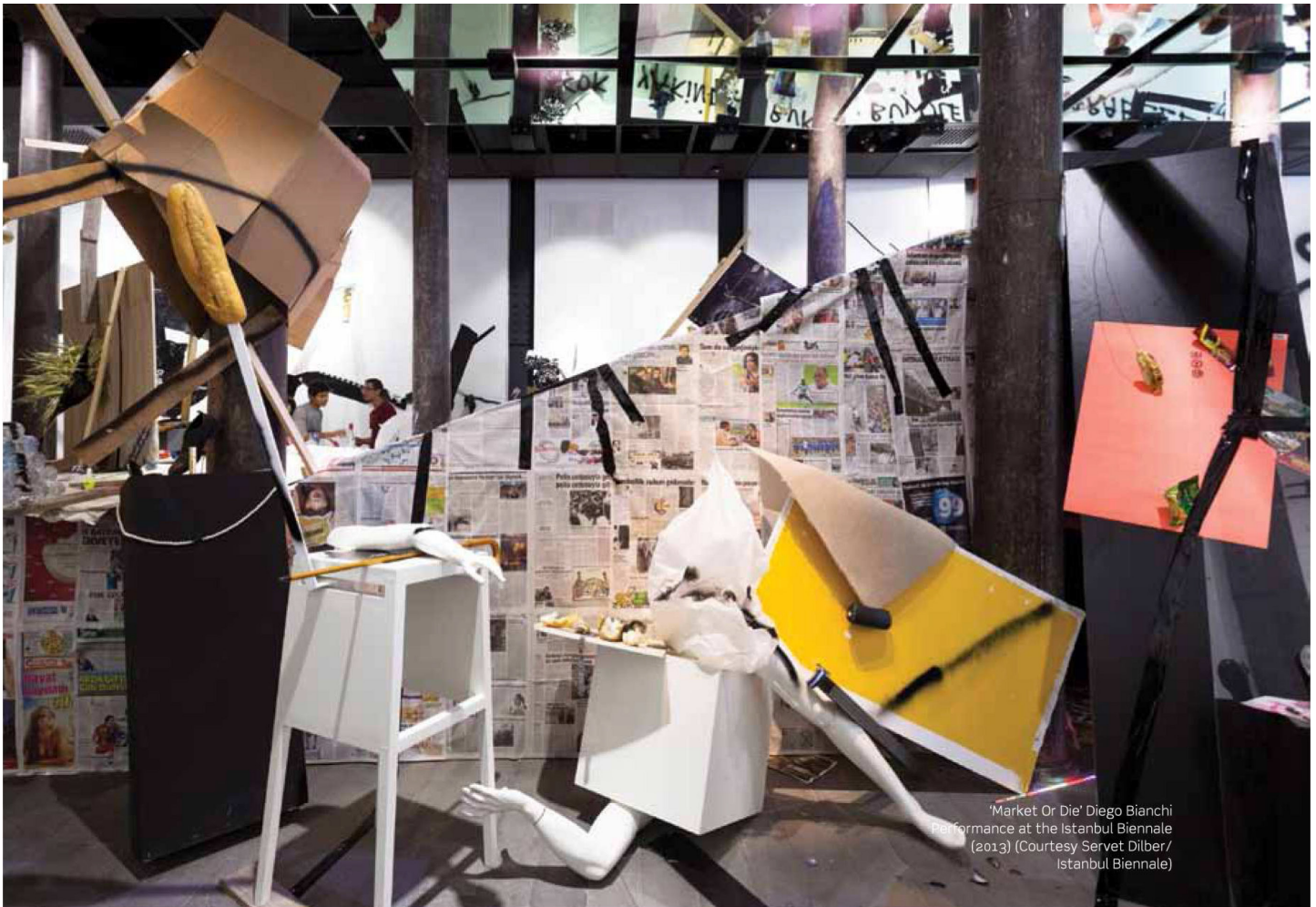
'Market Or Die' Diego Bianchi Performance at the Istanbul Biennale (2013)